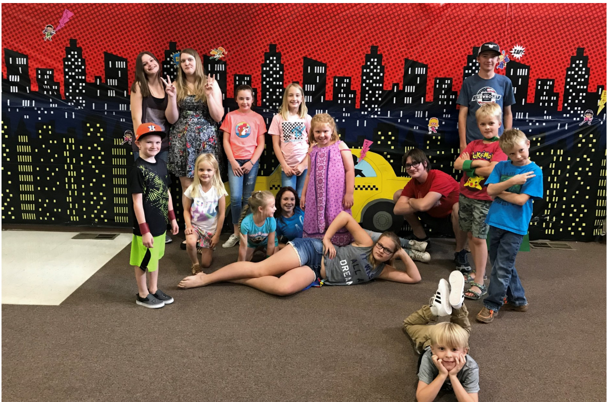
PICTURE OF SOME OF THE KIDS AND HELPERS AT VBS. THERE WERE 54 KIDS IN VBS THIS YEAR! AWESOME!